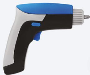
End-use drill-driver casing