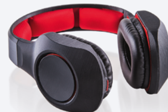
Functional headphones prototype