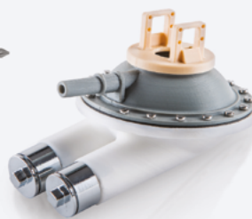
Artificial human heart model