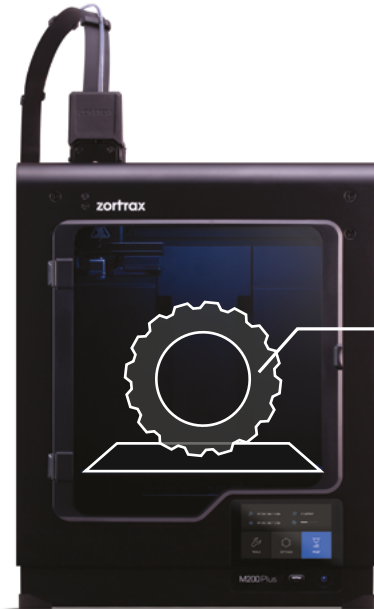
Zortrax M200 Plus 3D printer